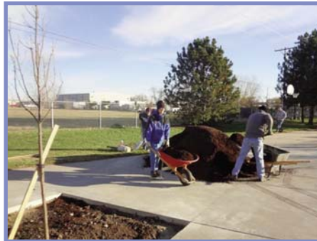
Members of the Little Apple Pilot Club and Big Lakes staff put mulch around newly planted shade trees.